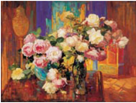
from top: Franz Bischoff, Alpenglow ; Roses (Private Collection)

in St. Louis. He founded the Bischoff School of Ceramic Art in Detroit and in New York City. Additionally, he formulated and manufactured many of his own colors, participated in exhibitions and won several awards, earning a reputation as “King of the Rose Painters.”